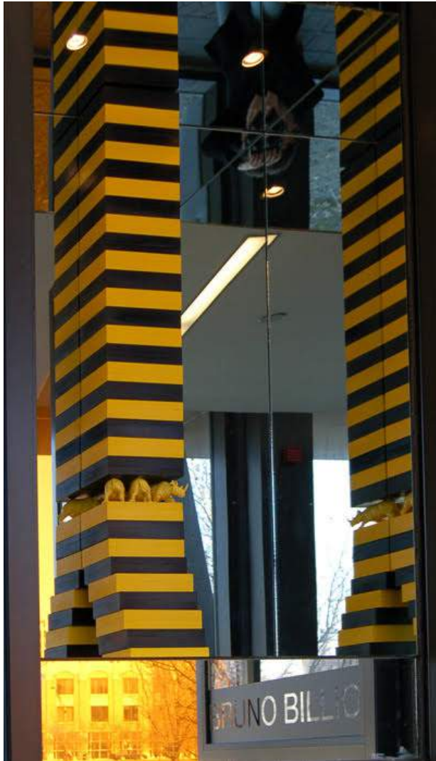
“Out There” The Art Gallery of York University (Toronto, ON – 2008) Lacquered Wood and High-density Plastic Figurines