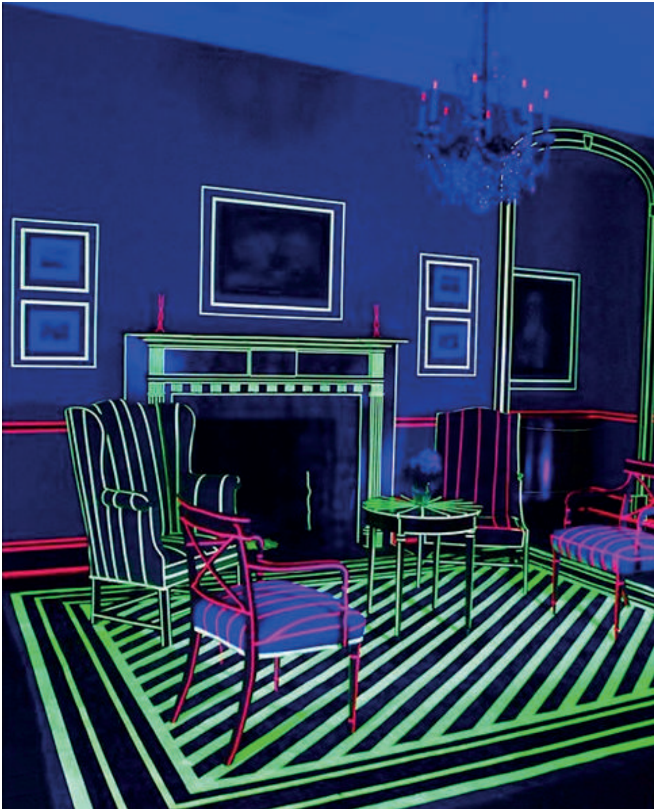
"Tron" Nuit Blanche, The Campbell House (Toronto, ON - 2019) | Various Fluorescent Paper Tapes

The Historic Campbell house in Toronto was transformed into its 3D future of itself with Bruno's installation of TRON. Created for Nuit Blanche, viewers were swept into another as they traversed through the historical building. This analog effect achieved with neon paper tape and black light reimaged the traditional museum into a world of light lines and history.