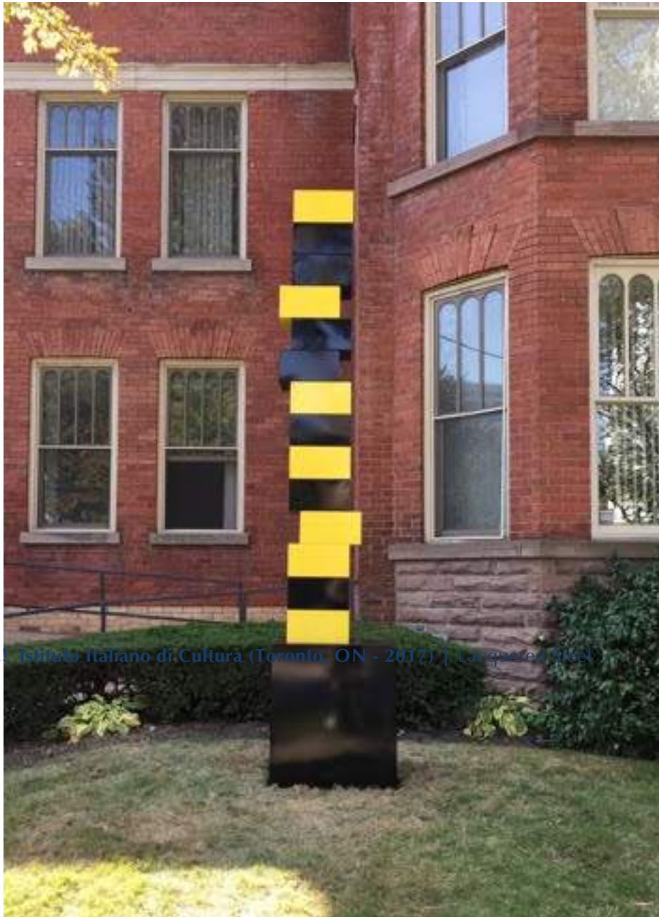
1. Istituto Italiano di Cultura (Toronto, ON - 2017) | Lacquered Steel

The sculpture is inspired by the artist that have exhibited at the Italian Cultural Institute in the past 40 years. Using custom made metal Yellow and Black steel boxes that are then stacked in an offset manner to give a sense of balance counterbalance to a height of 15 ft. These larger scale yellow and black steel boxes stacked precariously honour all the Italian artists who have shared their work at the institute and note their surnames: Italian painters, writers , filmmakers, poets and photographers that represent Italy's best. The base of the sculpture sits directly on the ground of a heavy black concrete pedestal. It is ever changing in the natural dynamics of nature, its colour and texture in sunlight, wetness of rain, and the shadows of the night. It also serves as a beacon to members of the public to visit and enjoy the Institute.