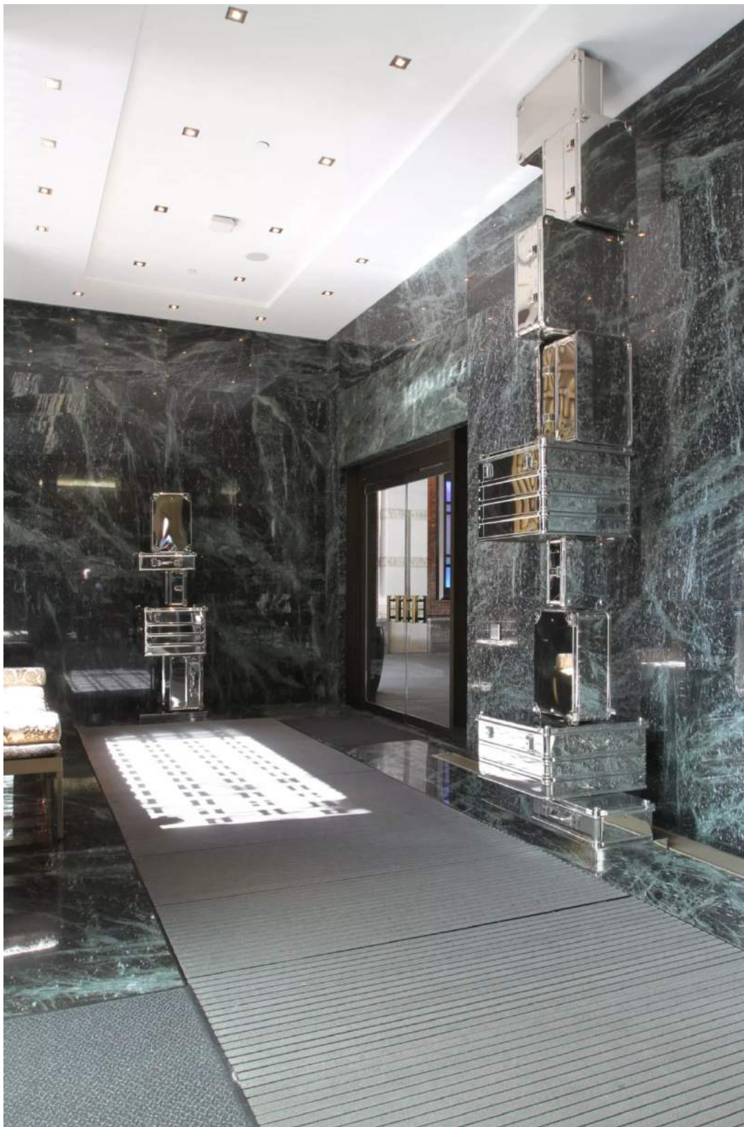
“Tower Suitcases” The Hazelton Hotel (Toronto, ON - 2007) Aluminum Nickel Plated

Nickel plated suits cases and trunks stacked to the ceiling, looking precarious as they balance on each other. These towering sculptures are intended to transform guest into modern day explorers. This piece evokes the elegance and story of the world traveller. The mirror pieces appear and disappear as you walk past and reflect the guests in a wash of liquid light. This iconic sculpture has become a treasure of the Hazelton Hotel.