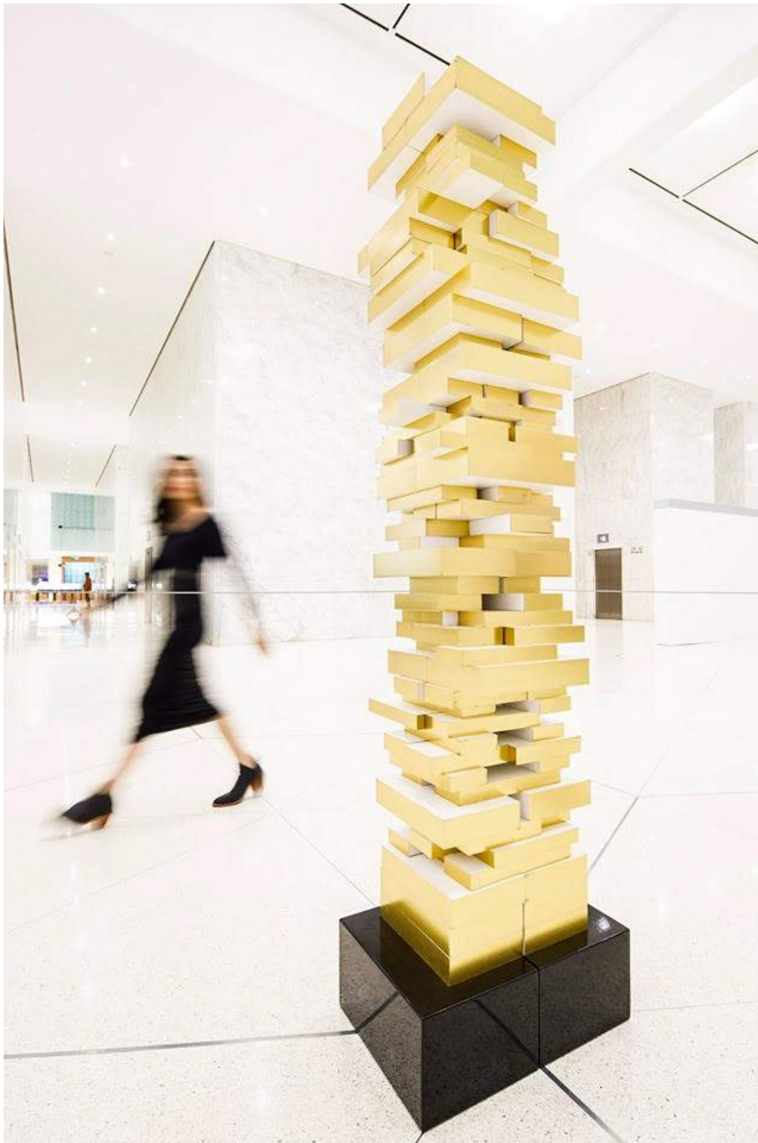
First Canadian Place (Toronto, ON - 2019) | Gilded Paper

The All that Glitters exhibition investigates “simulated” worth and the dazzling appeal of glistening, shiny surfaces that excavate their weight through captivating allure. The exhibition title is based on the proverb “All that glitters is not gold”, which was coined by Shakespeare in his original 1596 Merchant of Venice. The well-known adage has assumed a meaning suggesting that precious objects or a person’s genuine value cannot be based solely on the shiny exterior presented. In the play, numerous suitors are pursuing the beautiful, wealthy protagonist, Portia. She, however, is not free to choose whom she will marry as her late father has stipulated in his will that she must wed the man who correctly picks the one of three caskets that contains her picture. It is Portia’s character that inscribes the proverb into history by her written statement found in the caskets instead of her photograph: All that glitters is not gold; Often have you heard that told. Many a man his life hath sold But my outside to behold. Gilded tombs do worms enfold.