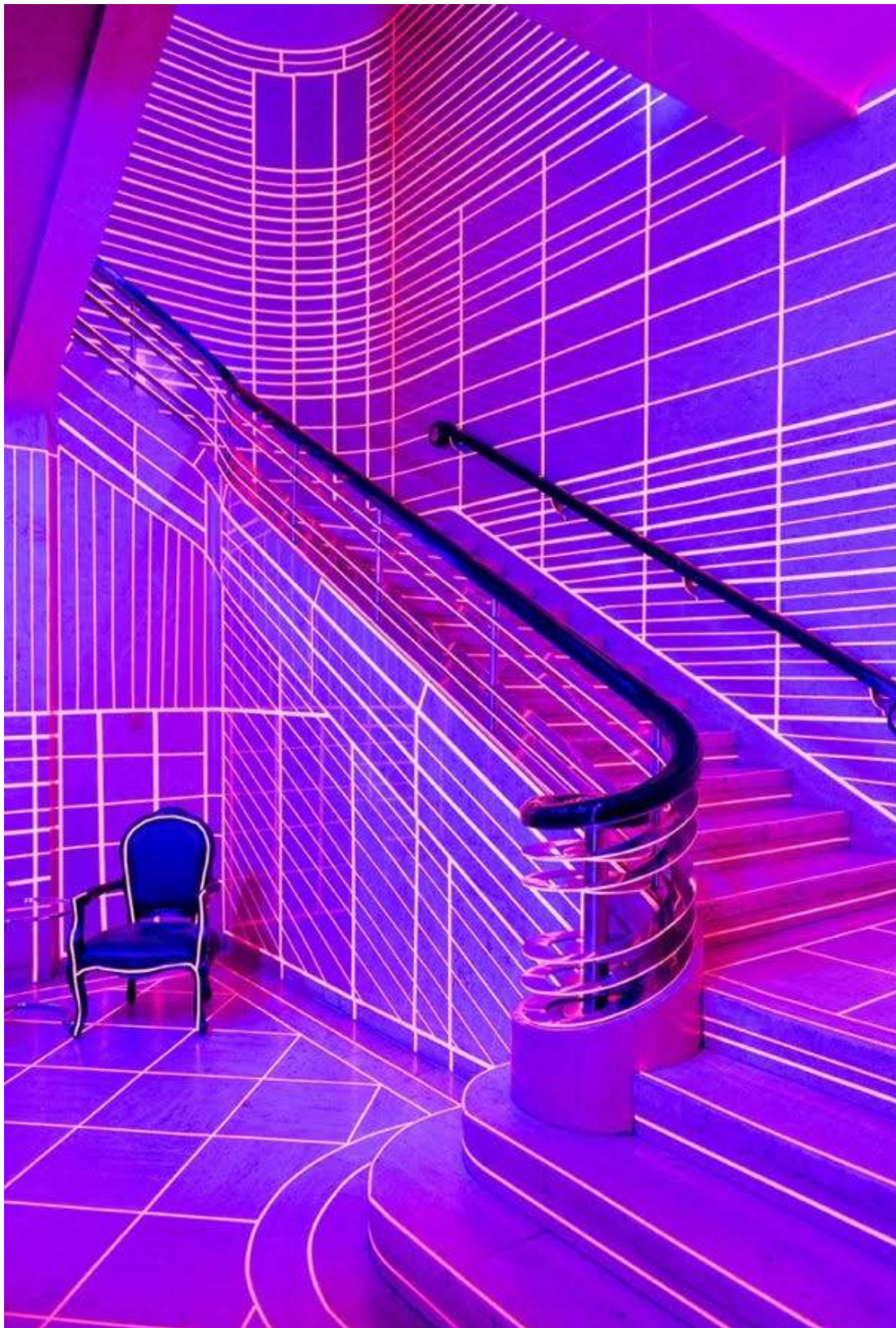
“Tron” FASHION Magazine Launch Party, Design Exchange (Toronto, ON-2020) | Various Fluorescent Paper Tapes

The grand staircase of The Design Exchange glows in hundreds of purple lines that define the details of the historic Art Deco era in celebration of FASHION Magazine’s spectacular relaunch party to celebrate all types of bodies and design. The one-night installation offered fashionistas a completely immersive artistic experience as they glided through the space to the main event. The effect of the fascia tape was to create an intense glow to seem as if the lines were made of actual light.