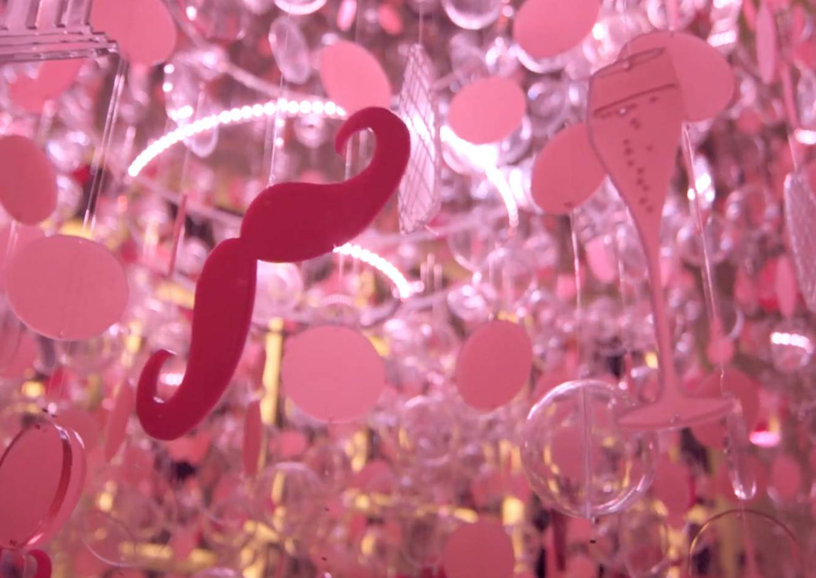
"Bubble of Wonder" (detail)