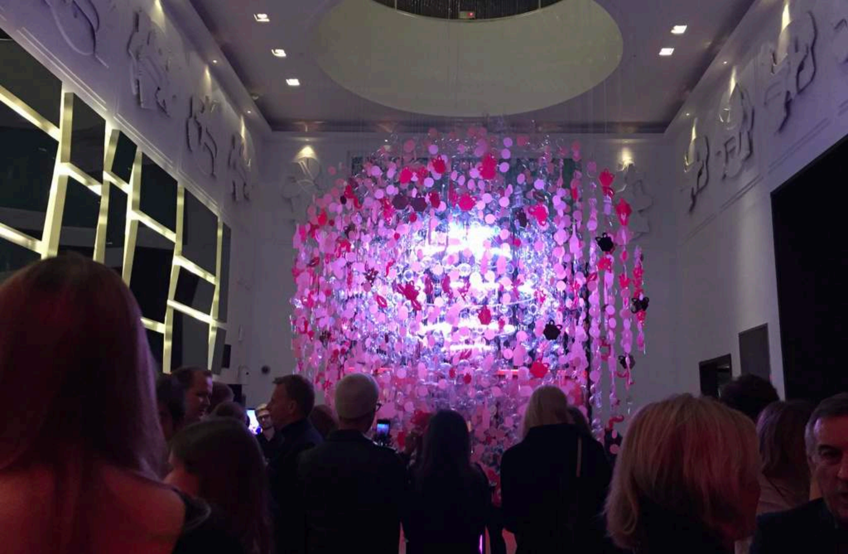
“The Bubble of Wonder” is comprised of 487 individually suspended wires and 1000’s of bespoke, laser-cut ornaments matched exactly to the pantone of Laurent-Perrier Cuvée Rosé. Motion sensitive, the installation’s lighting responds to the movements of guests and inspires discovery during the holiday season with Andaz London and Laurent-Perrier Cuvée Rosé. This project was produced in collaboration with Wild Flag Studios. Photograph from the gala opening.