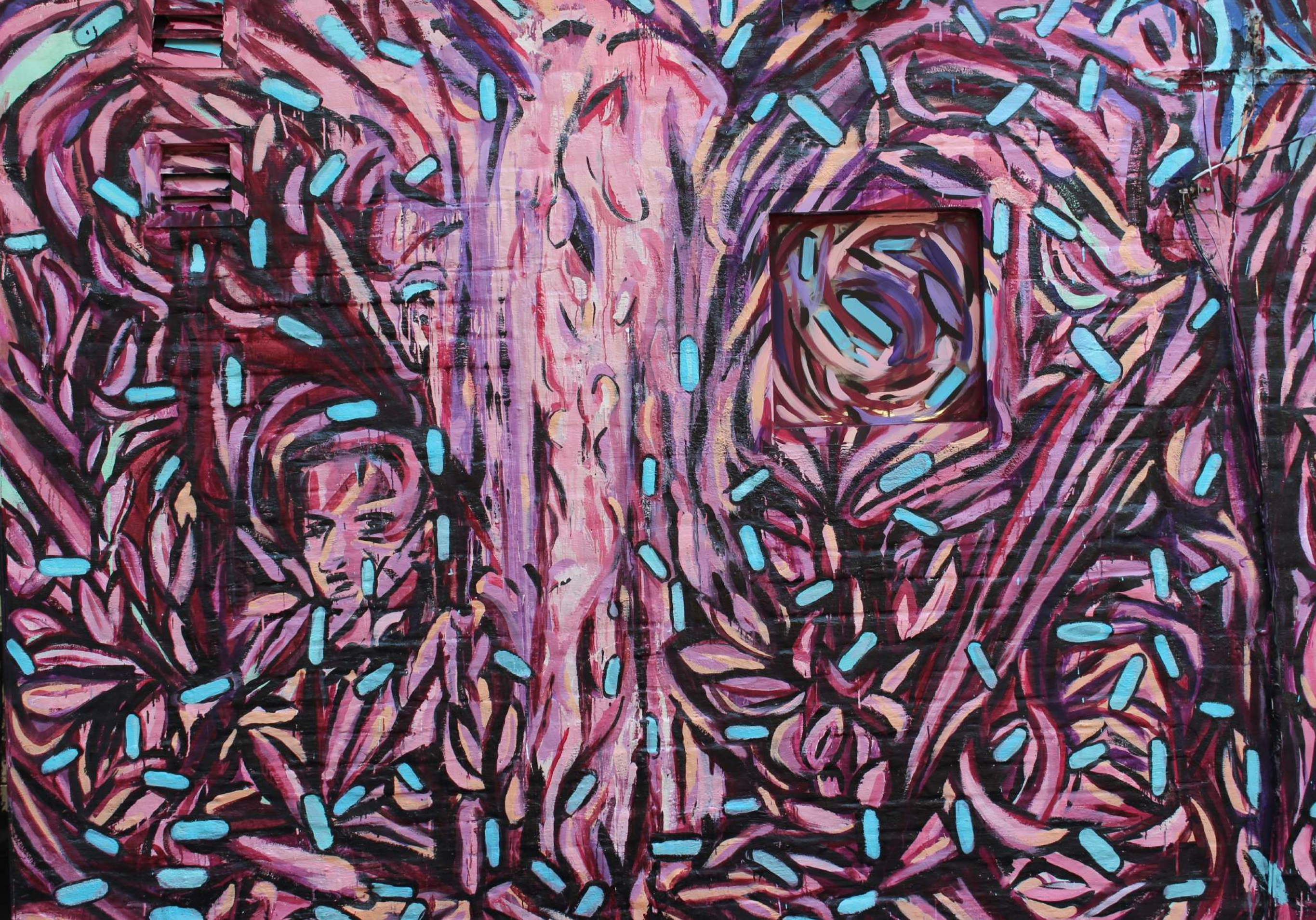
"A Foundation for a Poem" (detail)