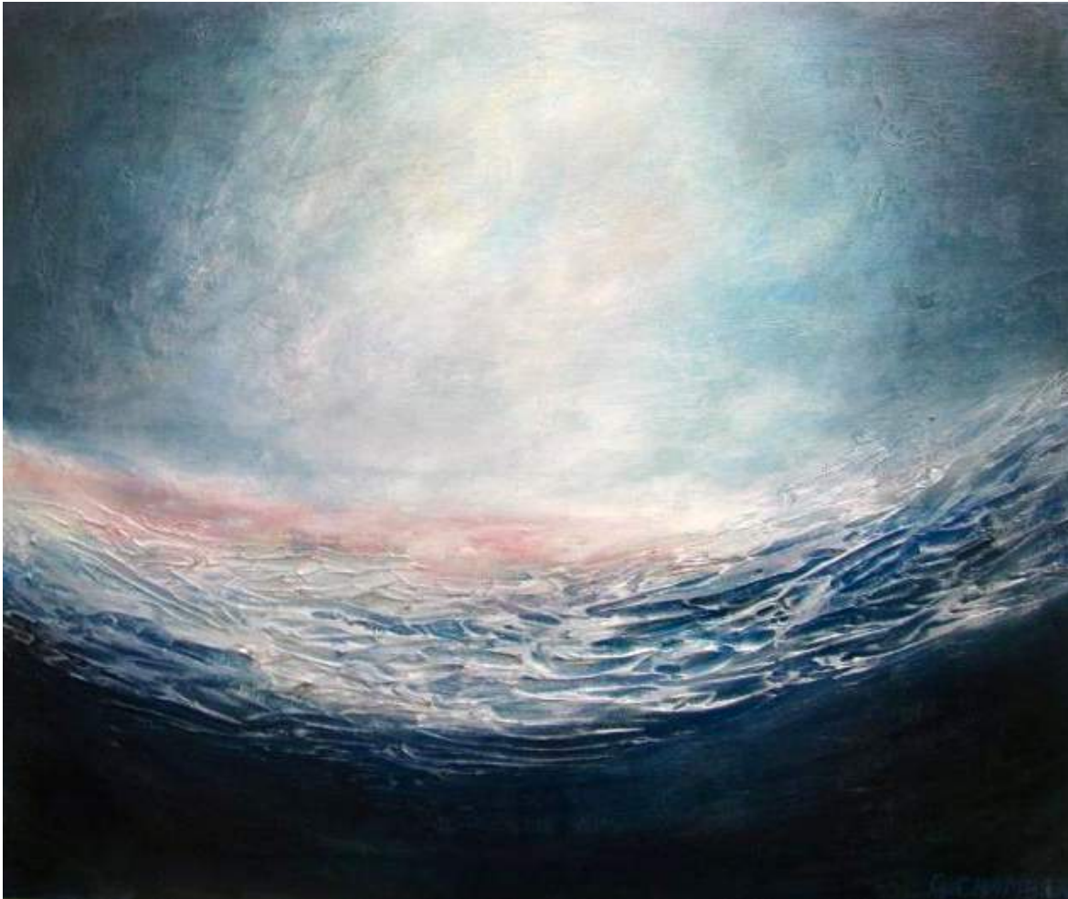
"Sky's Divide" 2013, Acrylic on Canvas, 48" x 36" Private Buyer