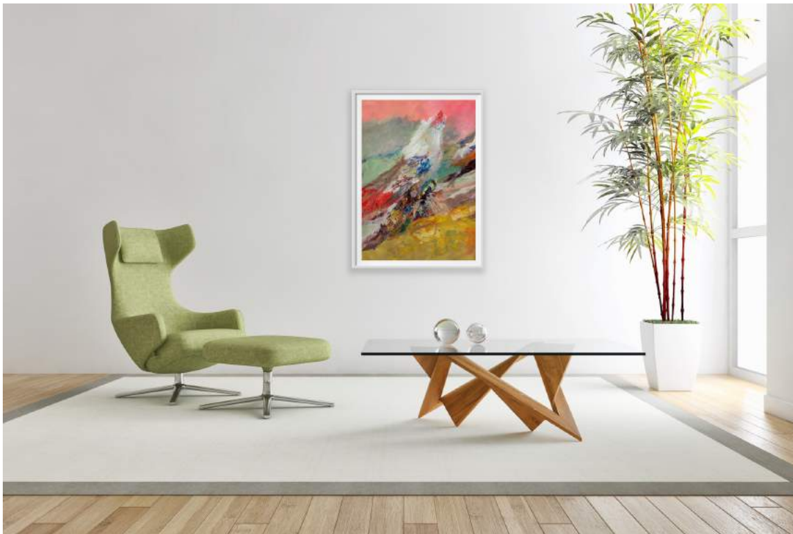
“New Wave” 2015, Acrylic on Paper, 24” x 36” $1750

Overlooking any concept of realism, the goal of “New Wave” is to create movement of one’s eye through out the painting using colour and composition alone. Bold colours in unexpected spaces allow a continuous flowing sensation, leaving only the white focal points for the eye to rest. This piece invokes chaos and calmness simultaneously.