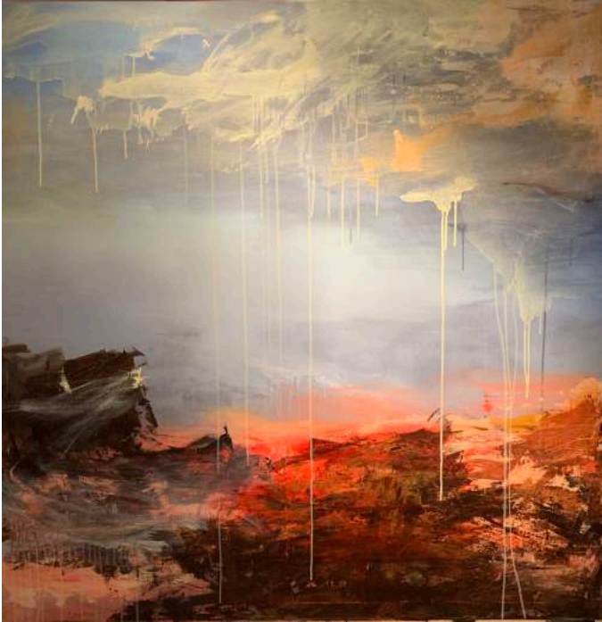
"Magdalen" 2019, Acrylic on Canvas, 48" x 48" Private Commission (For Private Collection)