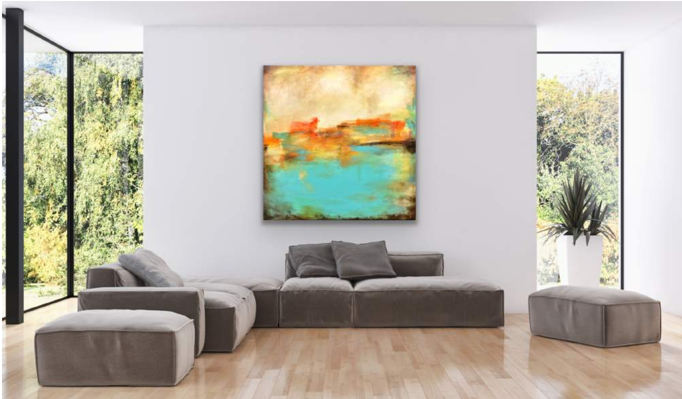
"Untitled" 2014, Acrylic on Canvas, 48" x 48" Private Commission (For Private Collection)

Placing this piece in any room would provide an intense pop of colour that changes the mood instantly. This was the buyer's intention when remodeling their home into a minimalist style accompanied by all-white furnishings. Golden tones with streaks of orange gestures were chosen to reflect the long modern fireplace below it, and a playful blue in contrast. This striking work remains the focal point of the buyer's living room for all guests to enjoy.