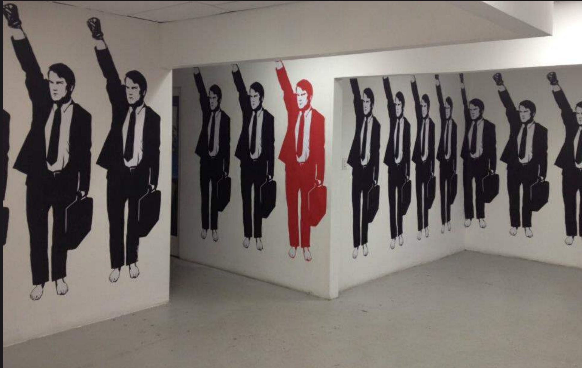
"Barefoot Financial Revolutionary"